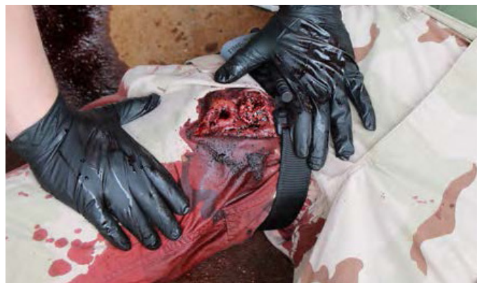
TOURNIQUET APPLICATION TO A LOWER EXTREMITY LIFE THREATENING BLEED