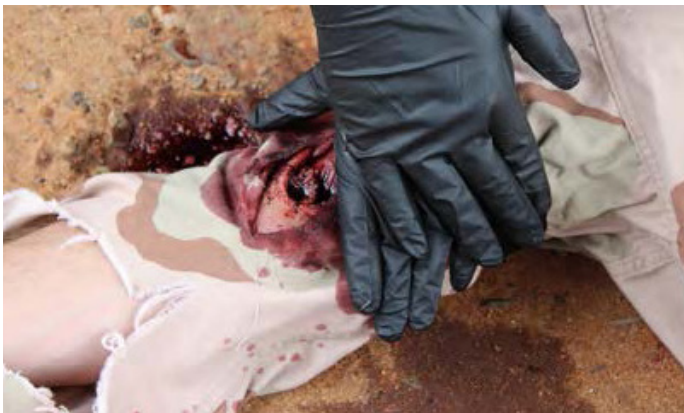
INTERNAL HEMORRHAGE COMPRESSION APPLIED TO AN UPPER EXTREMITY LIFE THREATENING BLEED