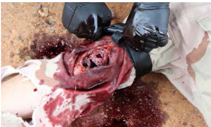
TOURNIQUET APPLICATION TO AN UPPER EXTREMITY LIFE THREATENING BLEED