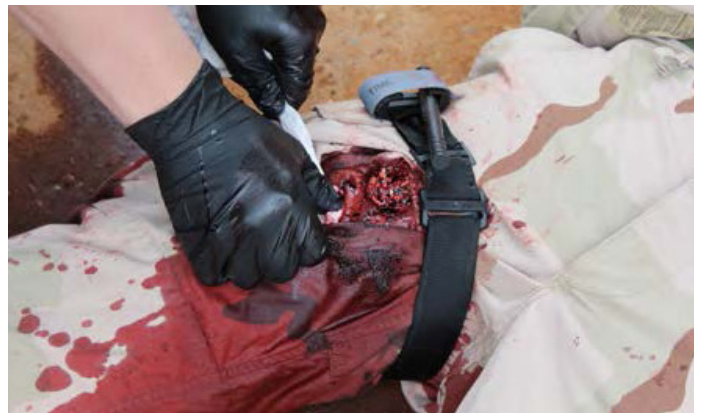
PACKING OF A LOWER EXTREMITY LIFE THREATENING BLEED