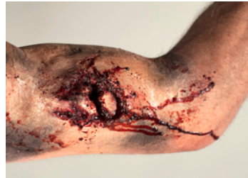
COMPOUND HUMEROUS FRACTURE