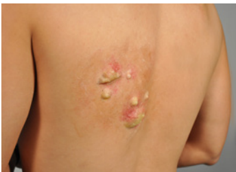
2ND DEGREE PARTIAL THICKNESS BURN