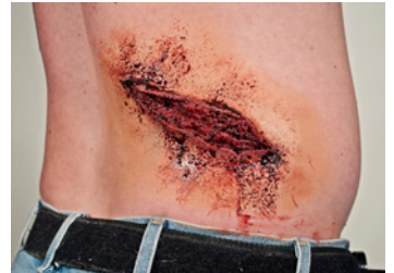
SUPERFICIAL LARGE LACERATION