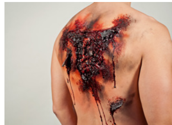
PENETRATING SHRAPNEL WOUNDS