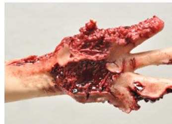
PARTIAL HAND AMPUTATION