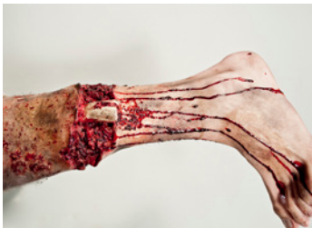
COMPOUND FIBULA FRACTURE