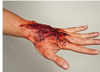
DORSAL HAND 1ST & 2ND DEGREE BURNS