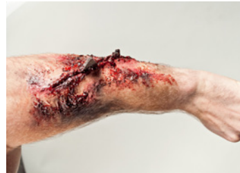
FOREARM LACERATION WITH SHRAPNEL