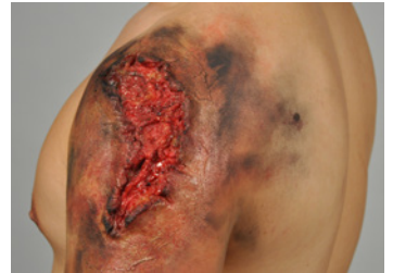
UPPER EXTREMITY 3RD DEGREE BURN