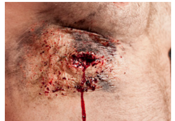
SUCKING CHEST WOUND