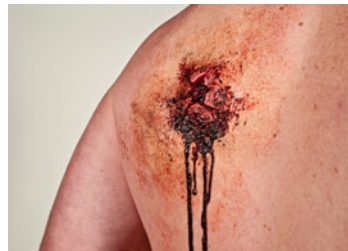
GUNSHOT EXIT WOUND