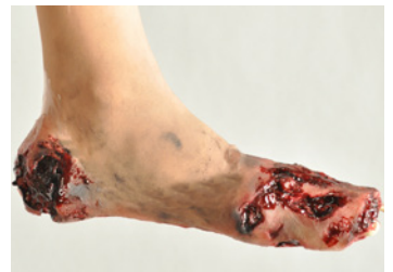
PARTIAL FOOT AMPUTATION