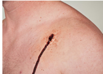
GUNSHOT ENTRANCE WOUND